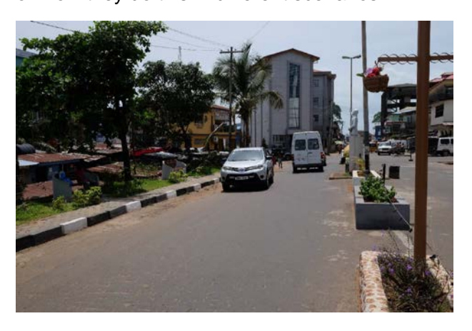
Flower pots, improved greening and new benches in front of the new City Hall.

There are many points of potential exchange between the two cities. Both can learn from each other's approaches and practices. So far, exchanges have focused on participatory practices in urban regeneration with both cities providing inputs on how they do this in different scenarios.