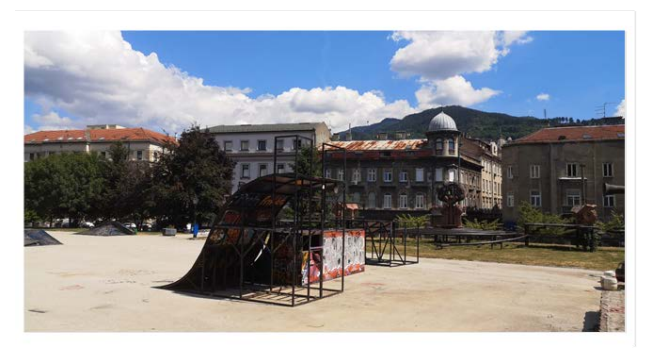
Public space in the city of Sarajevo.

Today, despite mechanisms for public participation evident in legislative frameworks, processes are not transparent and possibilities to participate in such procedures are limited. With the support of this project, Sarajevo will improve its urban planning and management capacities based on reliable data, good quality analysis and multi-stakeholder engagement.