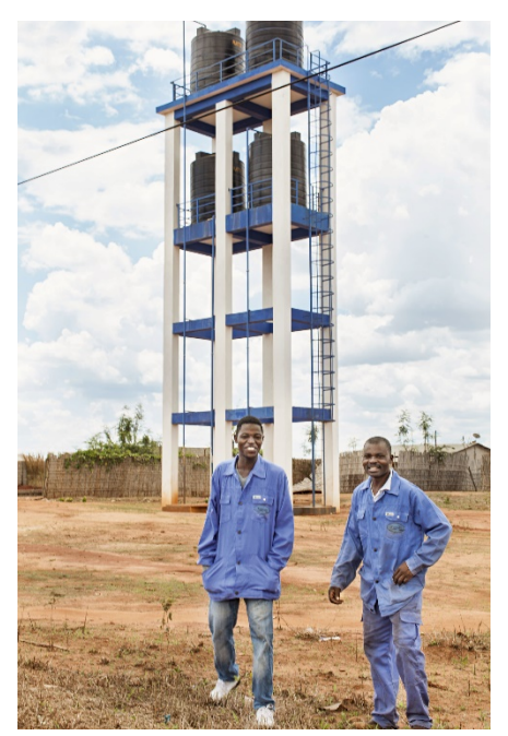
Water towers ensure a secure water supply in small towns.

measures by the trained authorities, companies, craftsmen and water commissions.