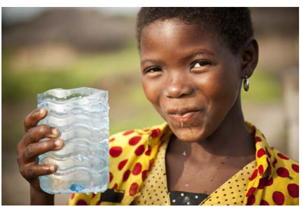
Safe drinking water from the new build well.

According to Mozambique's water policy, municipal authorities are to cooperate with local water commissions and private companies to ensure that the water supply functions more reliably and is expanded. In the remote north of the country, however, there is little experience available and a strengthening of the actors is necessary.