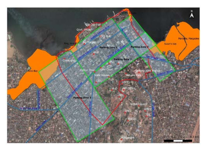
CBD showing regeneration zones Graphic: SLURC (Sierra Leone Urban Research Centre)