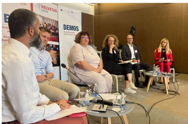
RAN Annual Meeting 2023, Prishtina

This Regional Advocacy Network (RAN) brings together like-minded individuals from diverse sectors, such as the private sector, national and local governments, academia, civil society, educators, and interest groups. Through regular virtual and in-person exchanges, participants discuss successful solutions applied by various Helvetas projects and partners. The network fosters consistent knowledge sharing, allowing participants to learn from best practices and tackle challenges specific to their country and the broader region.