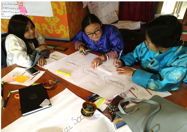
CSO activists draft their advocacy plan in Haa, Bhutan

Since Bhutan's democracy began in 2008, more and more CSOs, cooperatives, youth and women groups have registered with the state. They seek their place in society but face challenges with capacities and understanding their role. The Nyamdrel Project provided grants and strengthened CSO capacities in governance, finance and advocacy while promoting sector engagement and dialogue with the National Parliament through inclusive and transparent advocacy, media work, and lobbying.