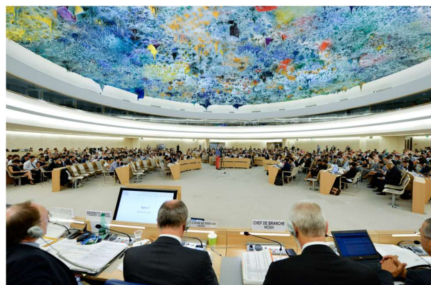
UN Human Rights Council, Geneva

Since 2018, Helvetas has advanced human rights-based advocacy across its thematic working areas. By advocating through the United Nations Human Rights Mechanisms or the European Human Rights Mechanisms, Helvetas advances specific policy issues in a structured and safe manner. In restricted political contexts, this has proven to be an effective way to convene strategic local partners and strengthen their networks and capacities for advocacy and policy dialogue.