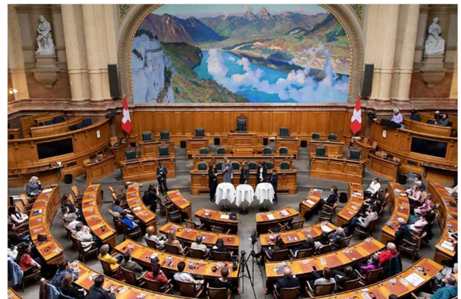
Swiss National Council

With the aim to make public procurement in Switzerland more sustainable, Helvetas and its CSO partners participated in the reform of the Federal Act on Public Procurement from beginning to end. Helvetas participated in public consultations and parliamentary hearings, engaged in discussions with the government, the public administration and the private sector, and lobbied members of parliament – with the result that the new Act explicitly allows for and fosters socially sustainable procurement.