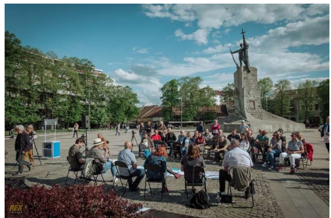
Citizens meeting in Kraljevo, Serbia (polekol.org)

Amid the backdrop of a steady decline in democratic governance, For an Active Civil Society (ACT) supports Serbian CSOs in strengthening their institutional capacities as well as their accountability and responsiveness towards citizens; facilitates CSO networks for common issues of concern; and fosters exchange and collaboration between CSOs and local governments with the aim to advance citizen engagement for inclusive and sustainable development.