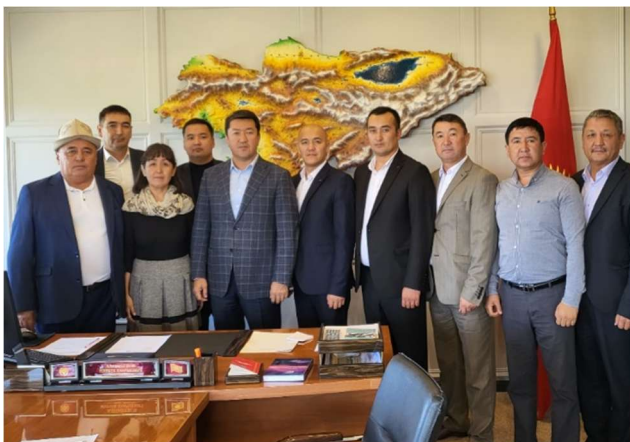
Community representatives meet with national parliamentarians to discuss local irrigation issues

The Irrigation Water Integrity Project in Kyrgyzstan (IWIP) initiated and supported a bottom-up advocacy campaign for improved national legislation on local self-government and irrigation. Local actors lobbied the highest level – and succeeded in creating frame conditions for sustainable irrigation at the local level and improving local governance. Today, IWIP is seen as a model for how INGOs can support grassroots advocacy so that local communities can empower themselves and exert political agency. The Turning Irrigation Reforms into Practice Project (TIRIP) now supports pilot municipalities in the effective implementation of the new law.