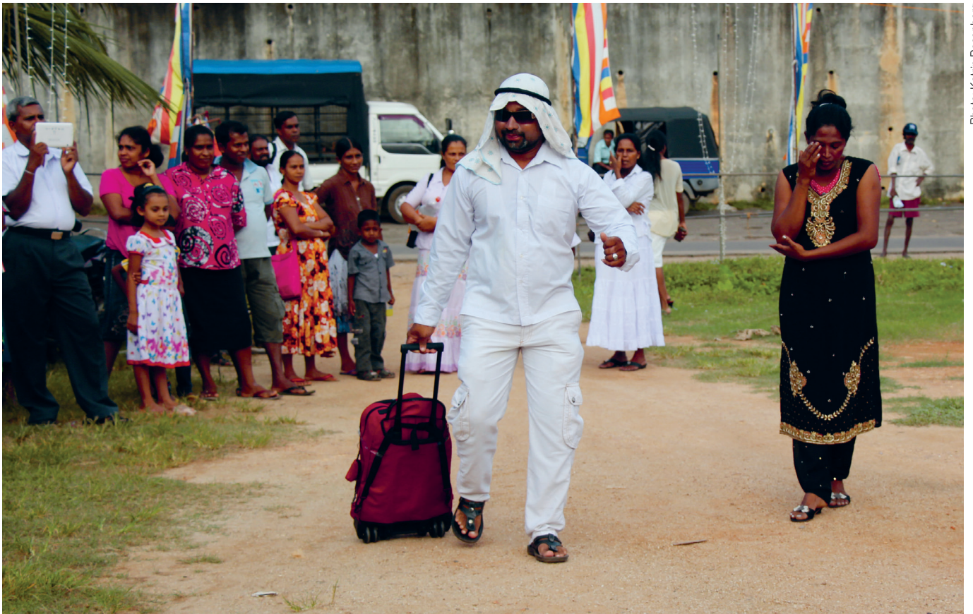
Streetdrama to raise awareness on safe labour migration