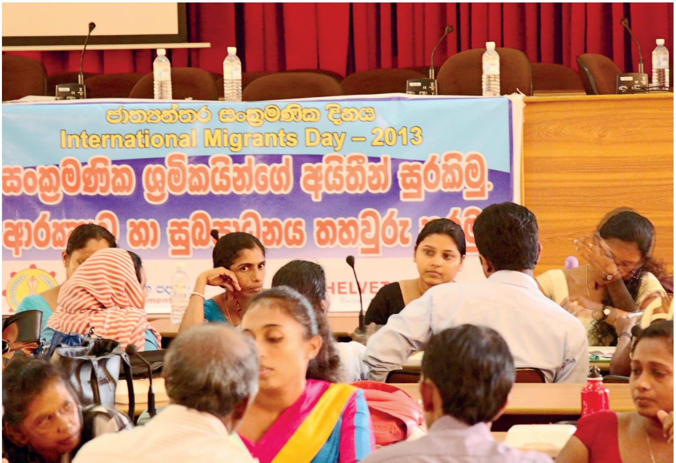
International Migrants Day 2013: Civil society and government officials discussing on how to jointly implement the 8 points agenda, approved at the UN High Level Dialogue on Migration and Development