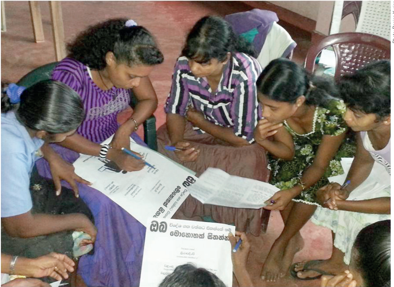
Designing a safe migration information poster